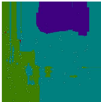
Figure 1: The model-space visualization generated by the command in step 7.

It is certainly conceivable that a graphical interface could be developed that would make it easy to perform an experiment like this one. Such an interface might even provide some mechanism to automatically perform the same experiment over an array of data sets, and using an array of different models. If, however, the user needs to vary a parameter specific to the experiment, such as the number of principal components, or a model-specific parameter, such as the number of trees in the ensemble, the benefits of a graphical interface are quickly overcome by additional complexity. By contrast, a simple script that calls CLI commands to perform machine learning operations can be directly modified to vary any of the parameters. Additionally, the scripting method can incorporate tools from other toolkits, or even custom-developed tools. Because nearly all programming languages can target CLI applications, there are few barriers to adding custom operations. Graphical tools are unlikely to offer such flexibility.